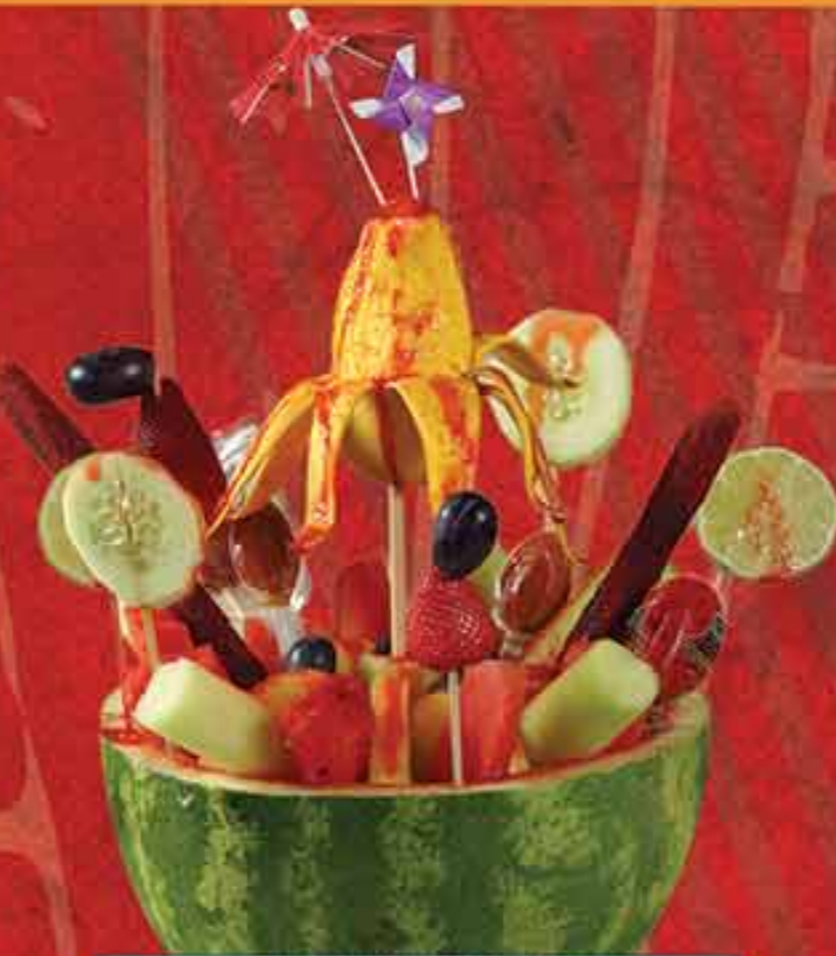
SANDIA LOCA GRANDE