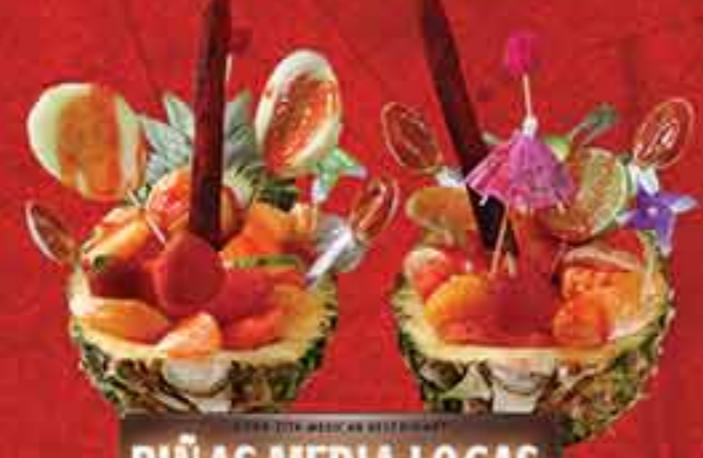
PIÑAS MEDIA LOCAS