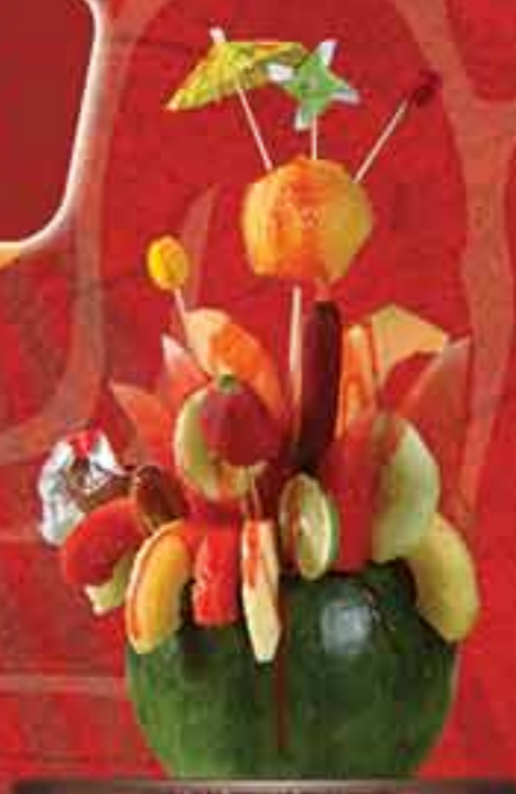
SANDIA LOCA PEQUEÑA